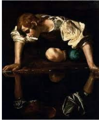
Caravaggio, Narcissus . 1597

In this new land an empowering song is pronounced, 'tis the projection of a joyful and abundant world proclaimed aloud with songs of gratitude reaching down to the deepest alcove of creation.