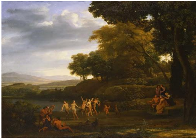
Claude Lorraine, Landscape With Dancing Satyrs and Nymphs . 1646